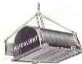
Fig. 1012. Suspension Type Klieglight.

The Suspension Klieglight, Fig. 1012, is identical to Fig. 1011, but consists of the hood alone without the stand. The hood is provided with hangers for suspension from above for overhead lighting. Each unit is furnished complete with rheostat and switch provided for wall mounting, and 50 feet of No. 8 stage cable. This Suspension type Klieglight can also be furnished in banks with two or four double burner hoods.